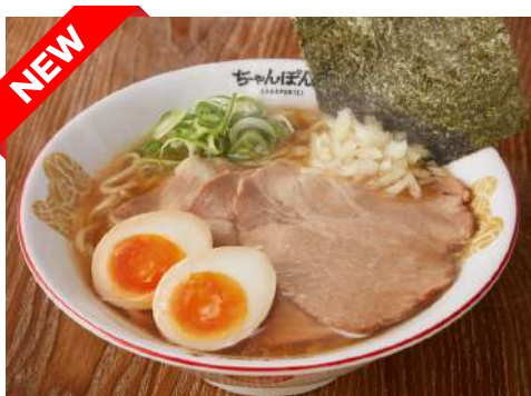
Special Ramen ¥1,200