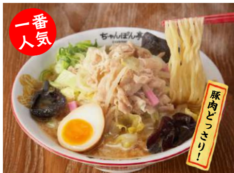
Pork Chanpon ¥1,150