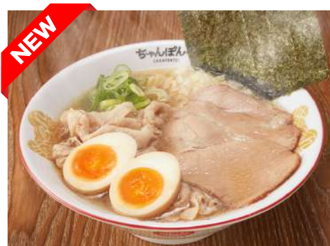
Special Pork Ramen ¥1,200