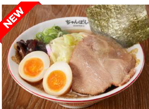
Special Chanpon ¥1,200