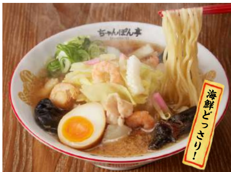
Seafood Chanpon ¥1,150