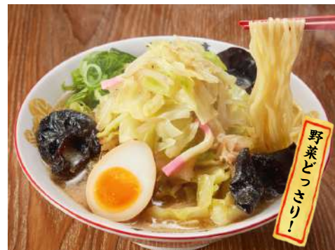
Vegetable Chanpon ¥1,150